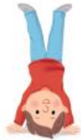
Stand on your hands