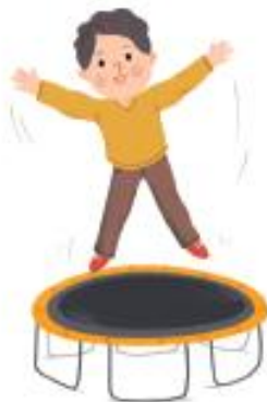
Jump on the trampoline