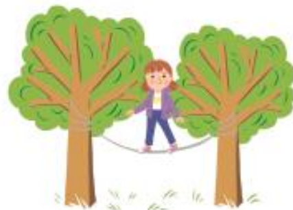
Walk on the wire