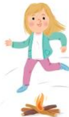
Jump through the fire