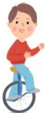
Ride on one wheel