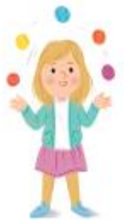
Juggle five balls