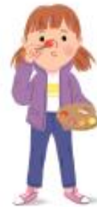
Paint your nose red