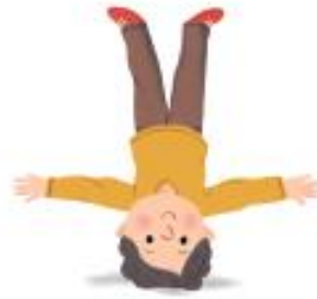
Stand on your head